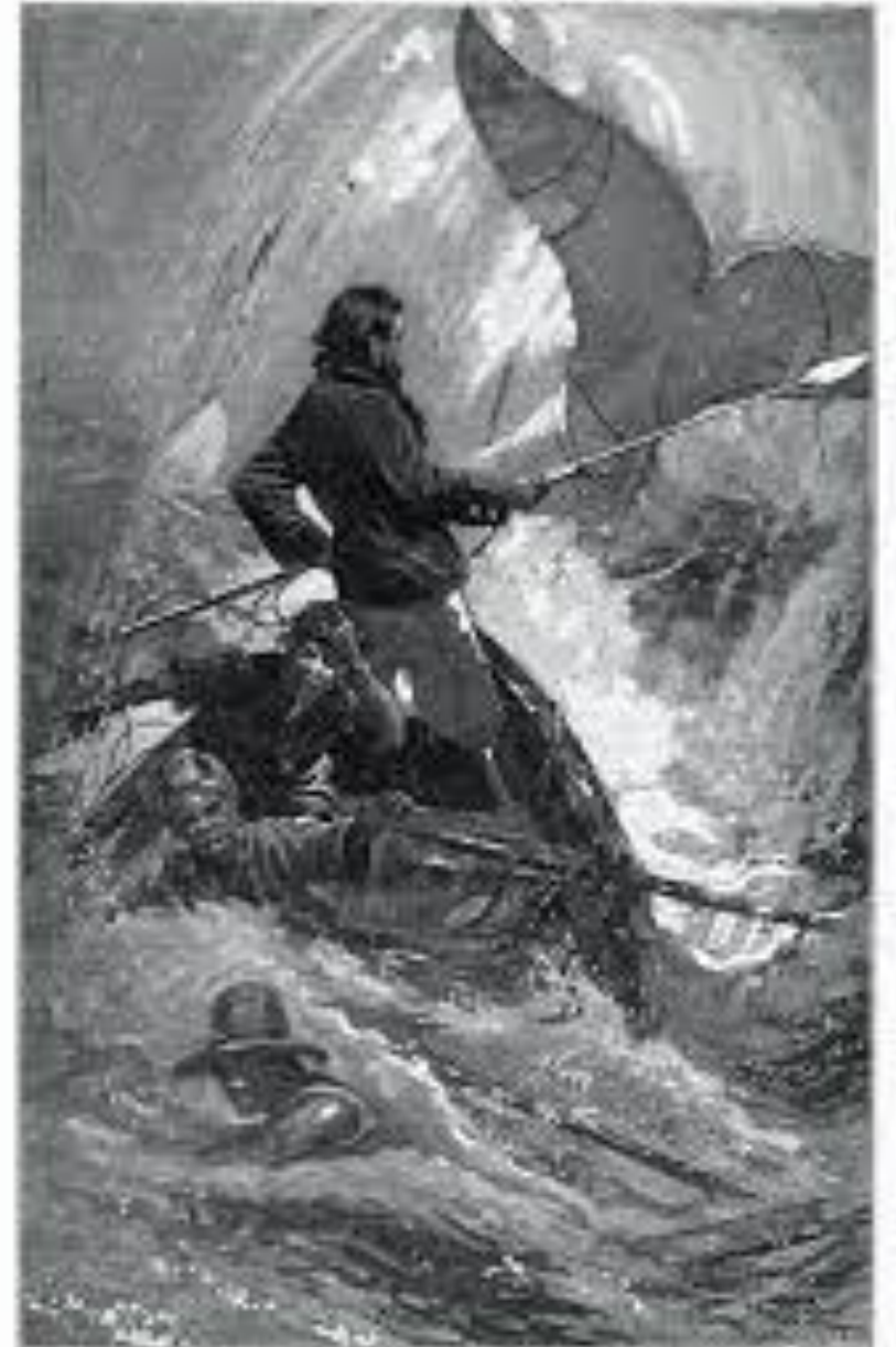
Moby Dick swam swiftly round and round the wrecked crew,